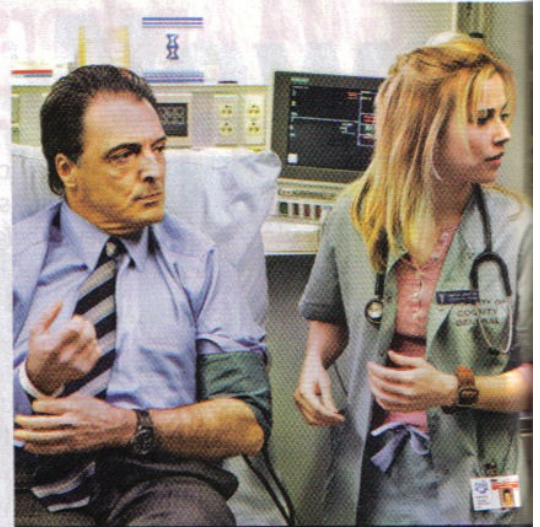
Assante starred on the soap The Doctors in the '70s